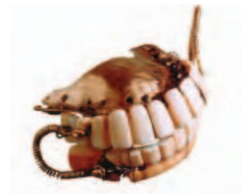
George Washington's Dentures